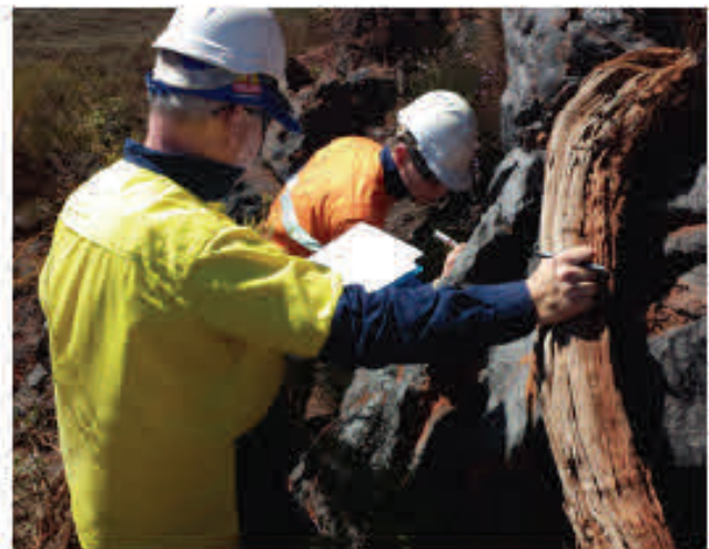
Kings Park research scientists planting seeds on Windarling ridge.