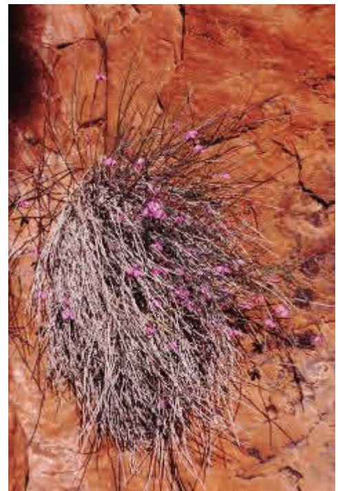
Photographs by Wayne Clarke taken in 1994