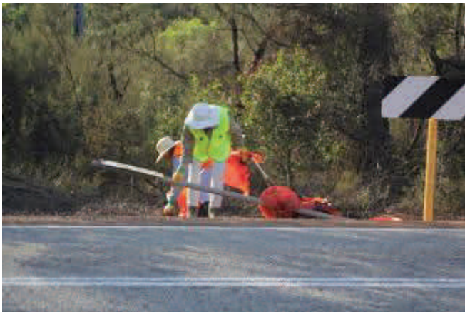
Above: Hard at work

A most productive morning, enjoyed by all.