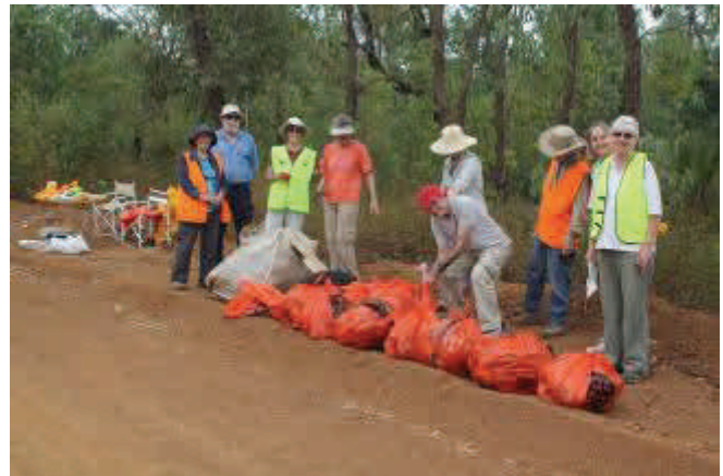
Above: The workers at the 'weigh-in'