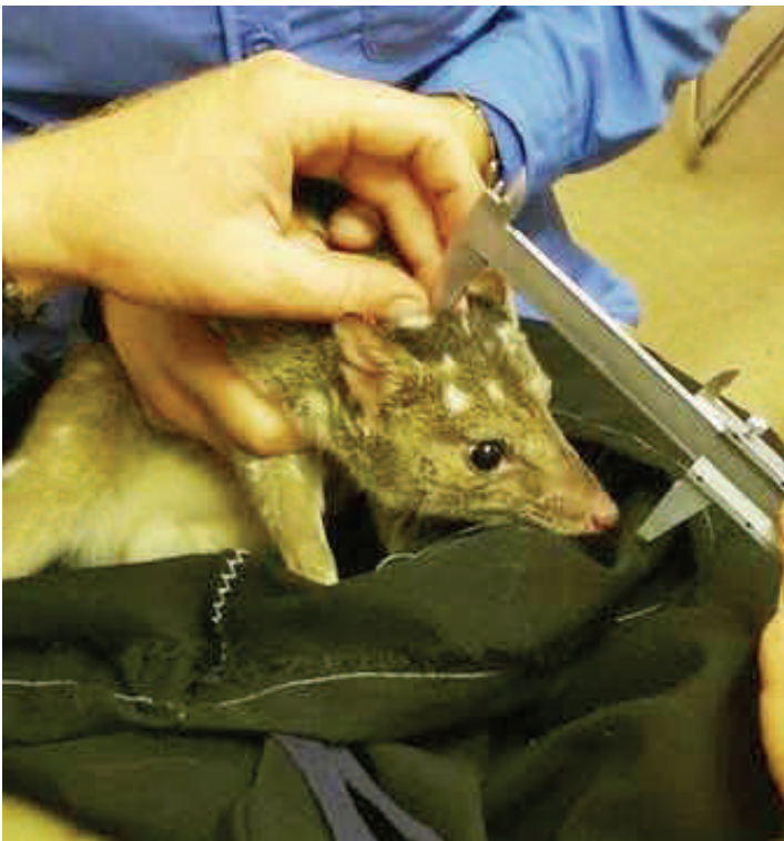
Left: Measuring the head length of a new sub-adult Idnya for age.